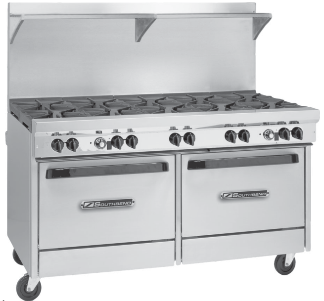
(shown with optional casters)

Standard Oven Std/ Conv. Oven Convection Oven 560DD 5606AD 560AA